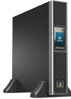
Liebert® GXT5 UPS