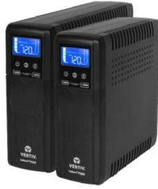
Liebert® PSA5 UPS