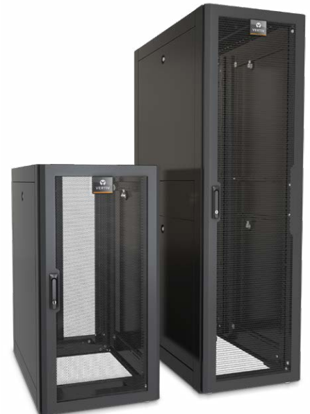
DCE™ Optimized Rack System