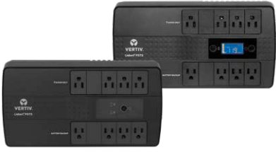
Liebert® PST5 UPS