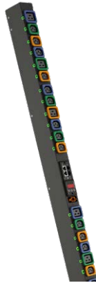
Vertiv™ Geist™ Rack PDUs Basic, Monitored and Switched Configurations