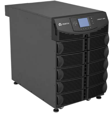
Liebert® APS On-Line UPS