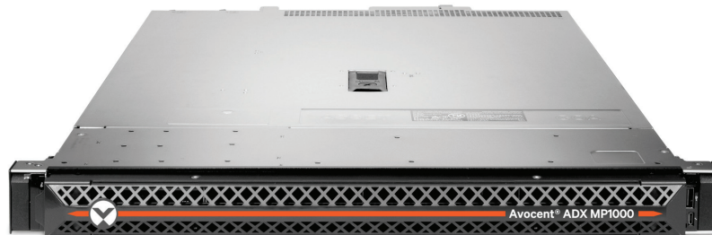
Avocent® ADX MP1000 Management Platform (Hardware or Virtual Appliance)

Demand for data center resources is growing, but particularly edge computing. Gone are the days of centralized core applications. Instead, organizations are leveraging cloud and edge computing to power digital business applications, optimize the processing of data-intensive workloads and create real-time analytics.