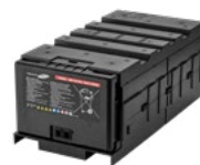
Samsung SDI lithium-ion battery module