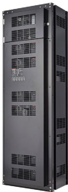
Samsung SDI lithium-ion battery cabinet

New fire codes such as NFPA 855 reference UL 9540A, a test method for evaluating thermal runaway fire propagation in Battery Energy Storage Systems (BESS). UL 9540A was developed to address safety concerns identified in the new codes and standards. The latest IFC and NFPA 855 documents allow the fire code official to approve larger individual BESS units, and separation distances less than 3 feet based on large scale fire testing conducted in accordance with the UL 9540A Test Method.