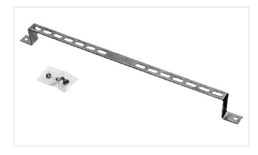
AS Bracket F603230