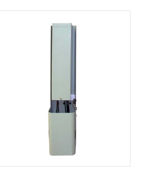
Kit Shown Installed with Cover On (UPCBD4 pedestal sold separately)

Designed for use in most FTTH applications, the Vertiv BBE BD Series Fiber Distribution Kit converts any standard UPCBD pedestal into a closed architecture, environmentally protected fiber distribution pedestal.