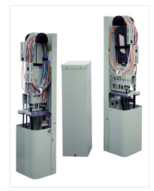
Feeder and Drop Sides Shown Installed with Cover Off (UPCBD5 pedestal sold separately)