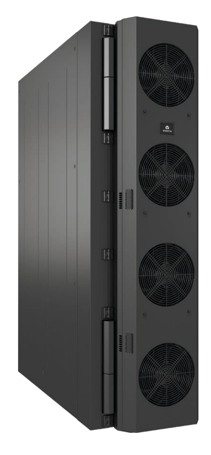
*Liebert® DCD50 only available in 800mm width.

By removing the heat at the rack and delivering room temperature air from the rack, the Liebert® DCD eliminates the potential of hot spots being created by the rack, reducing the strain on the whole system.