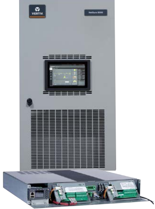
Kit for primary bay with door and chassis