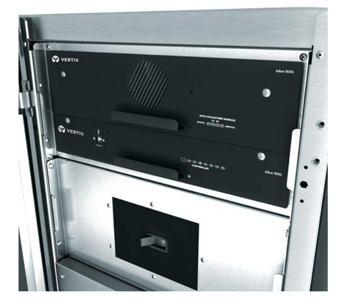
Liebert<sup>®</sup> APM battery cabinet with DCM/LM (top) and Controller (bottom)

Sealed batteries are sensitive to temperature and float voltage settings. Monitoring these conditions can considerably extend useful battery life.