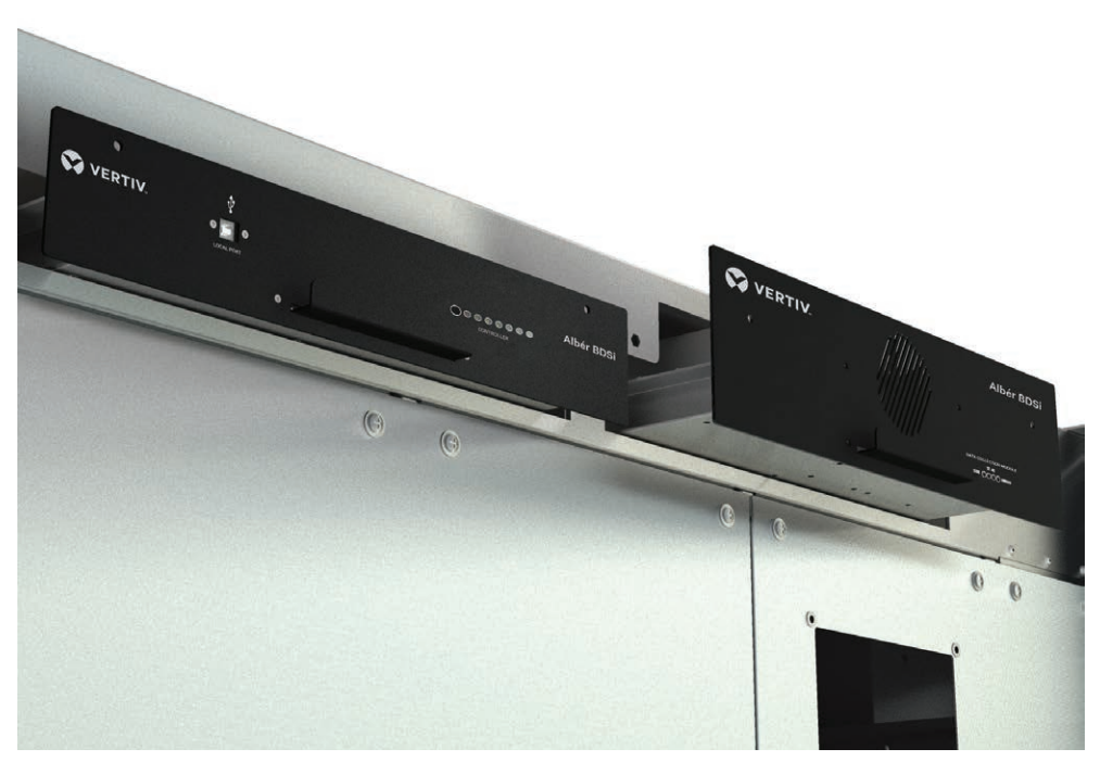
Albér™ BDSi Battery Monitoring provides real time information for proactive battery management

Albér™ technologies by Vertiv™ are designed to prevent battery failure, optimize useful battery life, reduce maintenance costs and increase safety.