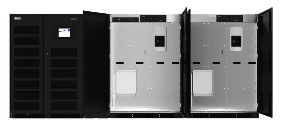
Liebert® battery cabinet with Albér™ BDSi Battery Monitor. First battery cabinet (center) with Controller and DCM/LM. Additional battery cabinet (right) with DCM/LM only.

The first battery cabinet includes both an Albér<sup>™</sup> BDSi Controller and Albér<sup>™</sup> BDSi DCM/LM. Each additional battery cabinet uses only an Albér BDSi DCM/LM unit linked to the single Controller Unit in the first battery cabinet. A Controller can communicate with up to six DCM/LM units or battery cabinets. Communication options are by Ethernet network card, RS-232 or dial-up modem.