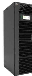
Liebert EXM™ UPS 10 - 250kVA