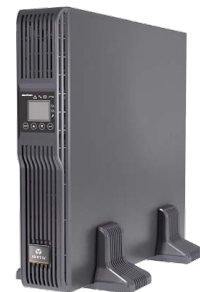
Liebert® GXT4™ UPS 500 - 10,000VA