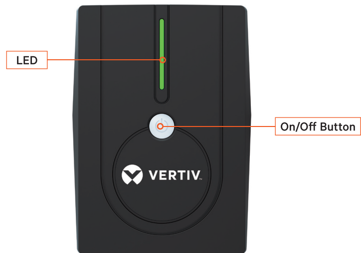
Vertiv™ Liebert® PSA-SOHO (PSA720-SOHO-LITE) Front

The PSA720-SOHO-LITE model is suitable for those looking for a UPS alternative that offers the same efficient protection for vital equipment against power disturbances, and the same reliable backup power support for SOHO applications at an affordable total cost of ownership.