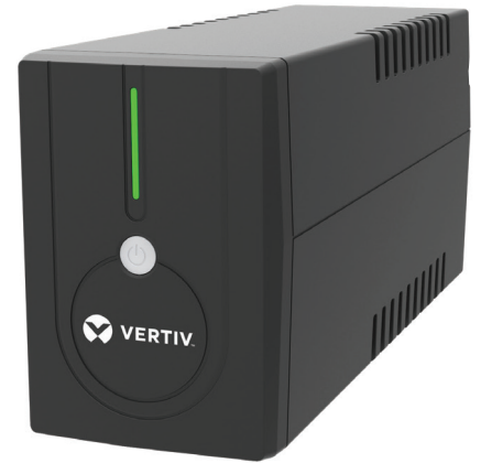
Vertiv™ Liebert® PSA-SOHO (PSA720-SOHO-LITE)