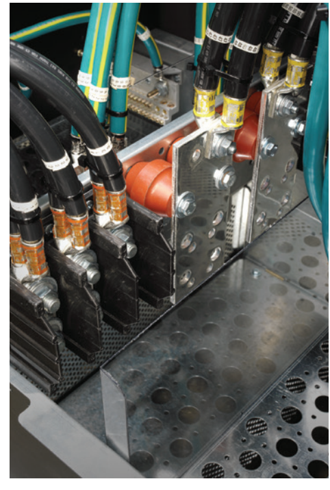
Input power connections with provisions for 2 hole lugs are standard on the Liebert FDC. (208V and 380-415V, 50 Hz model shown)

The Liebert FDC 208V and 380-415V, 50 Hz models use inline 42-pole panelboards with wide-open access channels. The four panelboards are separated into vertical compartments with individual hinged access covers. The Liebert FDC 380-480V, 60 Hz unit uses standard side-by-side 42-pole 400A panelboards, for more capacity at a higher voltage. With one panelboard in the front and one in the rear, there is plenty of space in each compartment for wiring. Hinged access covers allow easy access for service and reconfiguring.