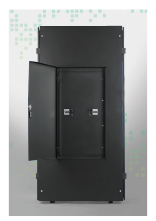
Optional Maintenance Tie-Breakers allow connection to different inputs without shutting down the load.