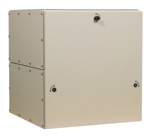
Dual-Stack Battery Module