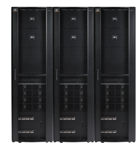
NetSure 9500 400V DC Power System Main Power Module (left) and Expansion Power Modules (middle and right)

NetSure 400V DC to -48V DC converter systems can also be used to extend the copper reduction benefits of 400V DC to existing -48V DC networking loads in core telecom applications.