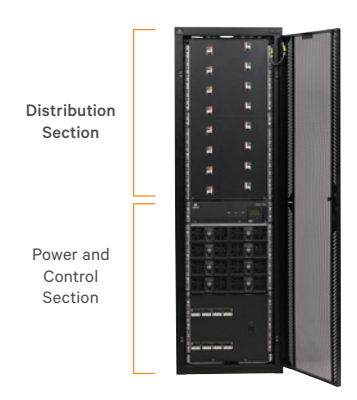
NetSure<sup>™</sup> 9500 Main Power Module with Integrated Load Distribution Panel