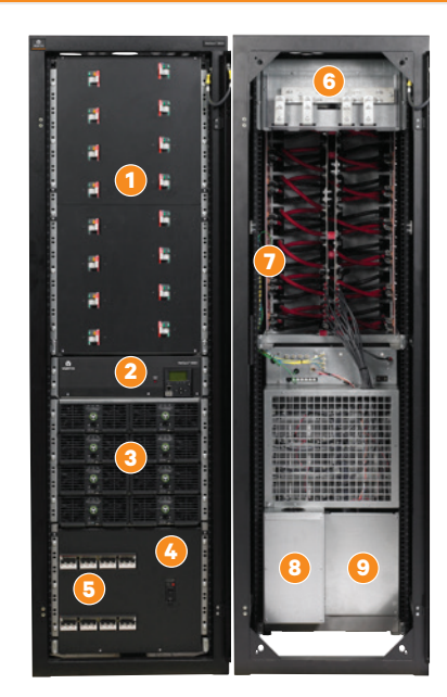
NetSure™ 9500 Main Power Bay with Integrated Load Distribution Panel