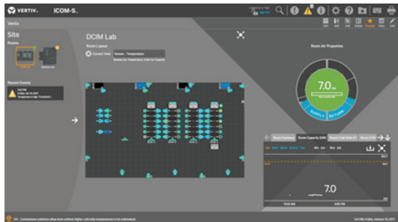
Liebert iCOM Autotuning continually monitors temperature, humidity and airflow sensors, and uses machine learning and advanced algorithms to fine-tune cooling