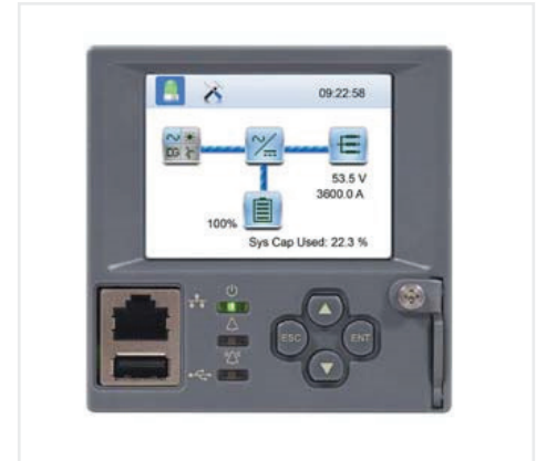
NetSure™ Control Unit User Interface