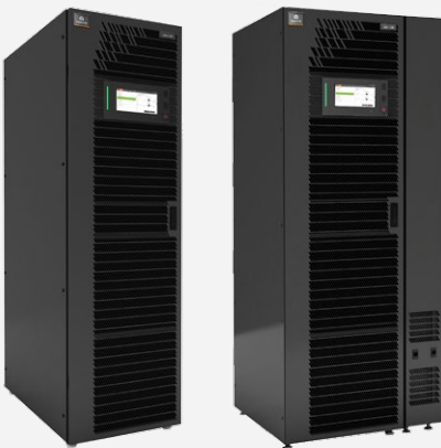
Liebert EXM UPS 10-40 kVA / kW