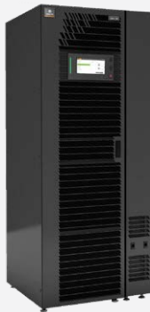
Liebert EXM UPS with 200mm Maintenance Bypass Cabinet

The Liebert® EXM™ UPS is now available in Quick Configure SKUs in order to enable rapid quoting and ordering. Simply select the kVA size and battery run time required, and for 30kVA and 40kVA sizes you may also select whether a 480 volt input transformer is required.