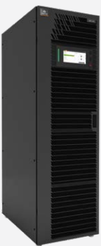
Liebert EXM UPS 10-40 kVA / kW