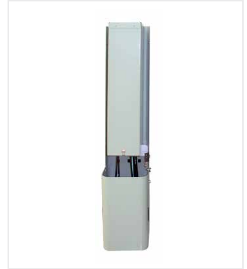
Kit Shown Installed with Cover On (UPCBD4 pedestal sold separately)

Knockouts on the rear of the UPCBD pedestal are used to mount the kit. This minimizes the need to stock multiple pedestals, since the same pedestal style can be used for fiber or copper applications.