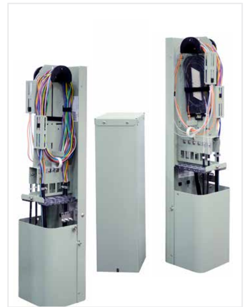
Feeder and Drop Sides Shown Installed with Cover Off (UPCBD5 pedestal sold separately)

Designed for use in most FTTH applications, the NetSpan BDE Series Fiber Distribution Kit converts any standard UPCBD pedestal into a closed architecture, environmentally protected fiber distribution pedestal.