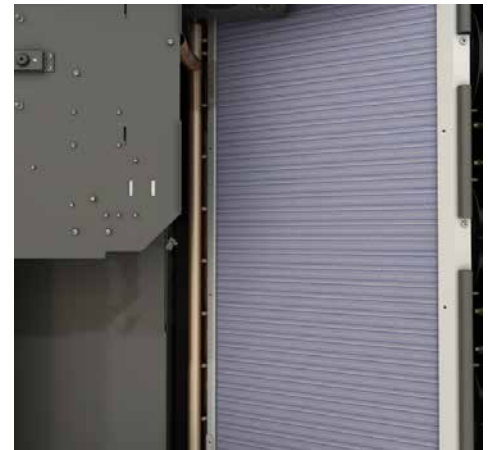
Hydrophilic Coated Coil