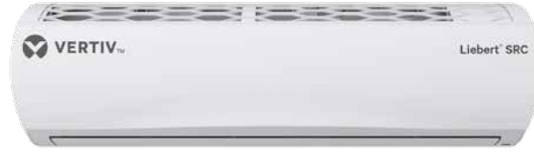
Liebert SRC Mini-Split Cooling System